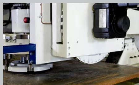
Disc marking unit