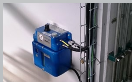
Lubrication of punches