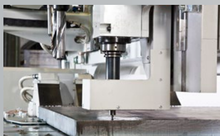
V-scoring fast scribing