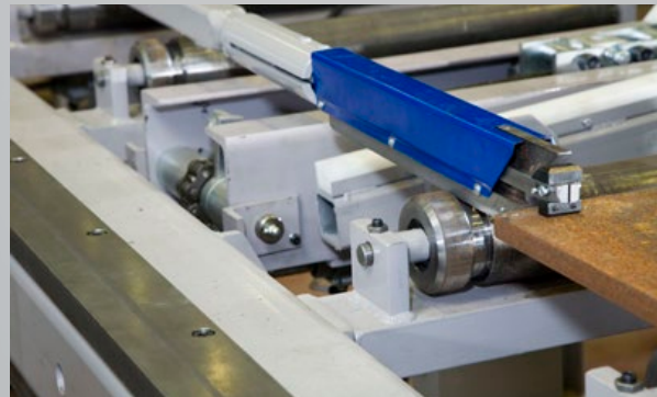
Infeed conveyor with grooved rollers