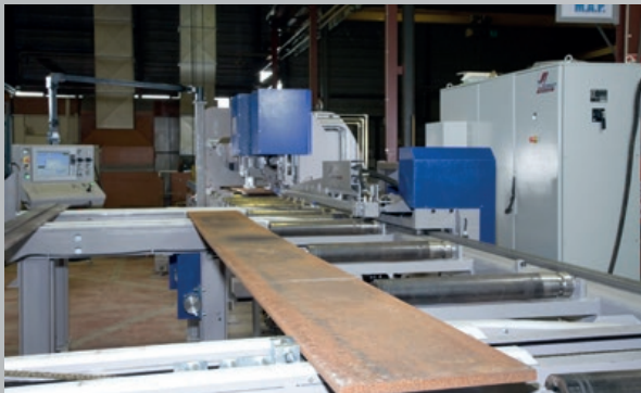
Loading chain with retractable finger