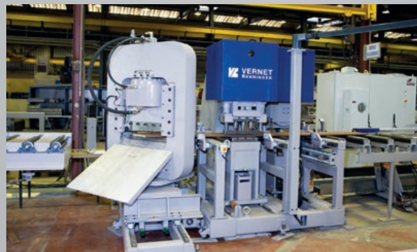
Rotary shear +/-45°

ZAE CAPNORD - BP 37423 13, RUE DE LA BROT F-21074 DIJON CEDEX PHONE : +33 380 73 21 63 CONTACT.US@VERNET-BEHRINGER.COM