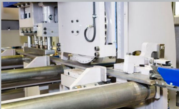
Disc marking unit